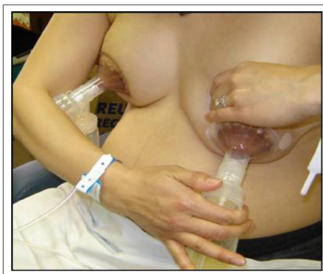
Hands-on pumping of milk after day 3

Even though you will probably remove only a small amount of milk with step 4, you will be sending a strong signal to your breasts to produce more milk. Develop your own style of hands-on pumping and you will feel the difference when your breasts are well emptied. Using hands-on pumping, not relying only on pump suction alone, will increase milk production and increase the richness of your milk.