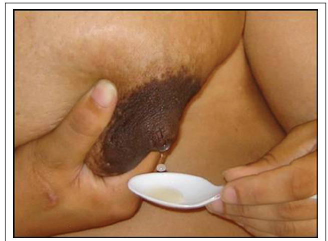
Hand expression of colostrum (early milk) in first 3 days